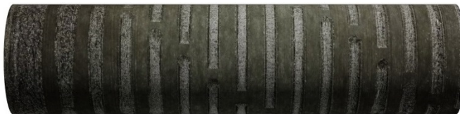
Figure 1 - partial bond profile

For use as a partially bonded underlay within a built-up roofing specification system. It is to be used only for main flat roof areas and roof pitches up to 5° if reliant on adhesion alone. For roof pitches over 5° this underlay should also be mechanically fastened in accordance with BS8217 table 5 or the IKO specification document.